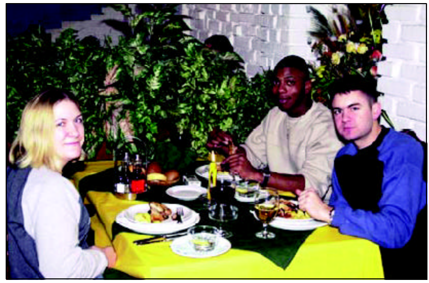
Soldiers enjoy a meal at Rio's Brazilian restaurant located in downtown Sofia.