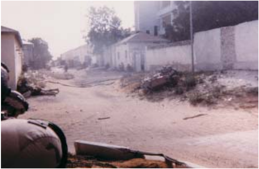
Soldiers of Task Force Ranger take cover and return fire during the 3–4 October battle.

After several months of comparatively limited activity and few further instances of violence, U.S. forces began withdrawing. Most of the American troops were out of Somalia by 25 March 1994, ending Operation CONTINUE HOPE, the follow-on mission to RESTORE HOPE. Only a few hundred marines remained offshore to assist with any non-combatant evacuation mission that might occur in the event violence broke out that necessitated the removal of the over 1,000 U.S. civilians and military advisers remaining as part of the U.S. liaison mission. All UN and U.S. personnel were finally withdrawn almost a year later in March 1995.