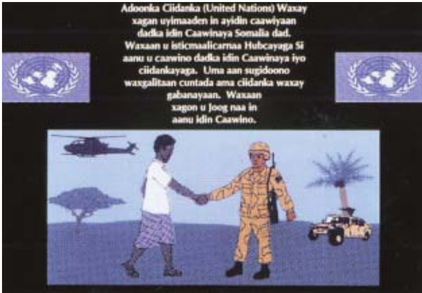
Over 7 million PSYOP leaflets were distributed during RESTORE HOPE.

and killed a young Somali who ran up to his vehicle carrying a small box that the sergeant believed might be a bomb. Despite the tragic nature of the event, charges against the soldier were dismissed under legitimate self-defense grounds. However, in another instance, a sergeant shot and killed an individual who had stolen his sunglasses. His claim of self-defense was rejected, and he was convicted at a general court-martial. On the whole, however, U.S. Army soldiers behaved with care and restraint. By April the situation had stabilized enough that the U.S. administration determined that it was time to turn the mission over to the United Nations entirely.